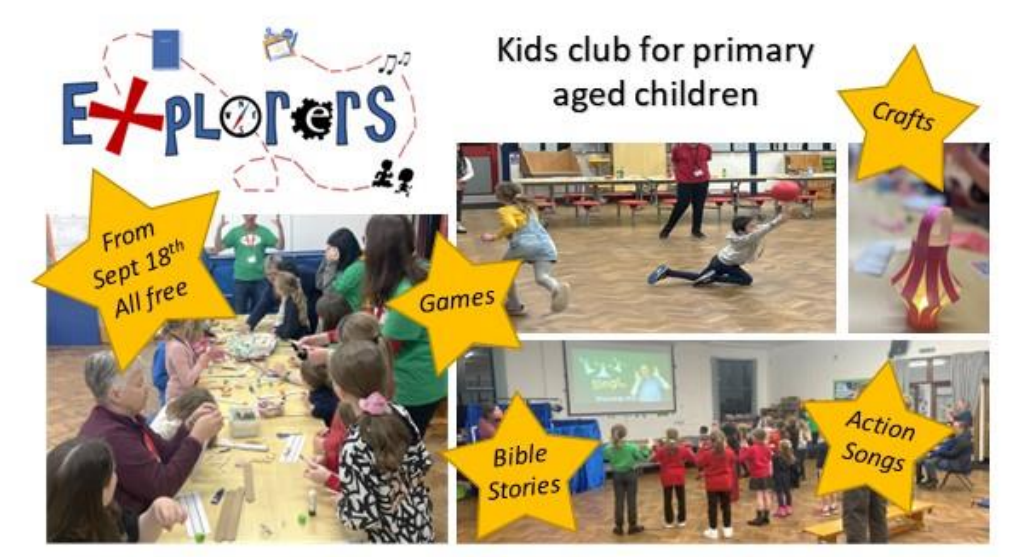
Mondays in term time, 5:30-6:30 at Emmanuel Church Leftwich